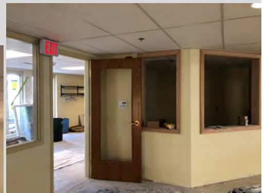
Front door to the Day Center and Case Manager's office.