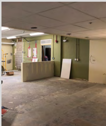
Future kitchen area to the right and children's area beyond 1/2 wall.

Construction continues on the new Women and Children's Center in the lower level of our Emergency Shelter building. Crews have framed the walls, hung drywall, installed doorways, and have tiled and hung fixtures in the bathroom. The prospective opening date is June 2019.